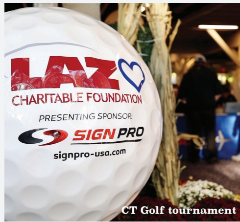
CT Golf tournament