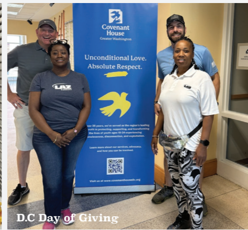
D.C Day of Giving