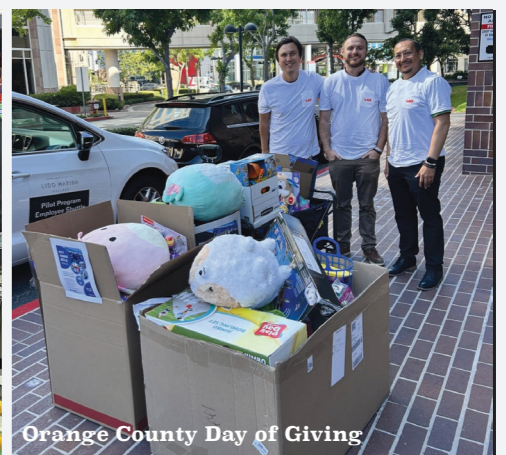
Orange County Day of Giving