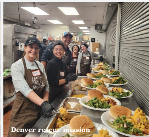
Denver rescue mission