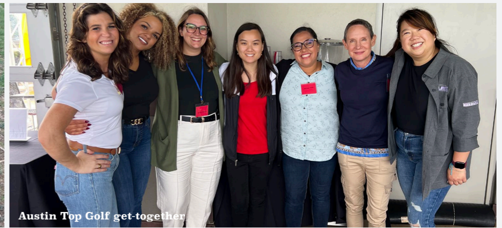
Austin Top Golf get-together