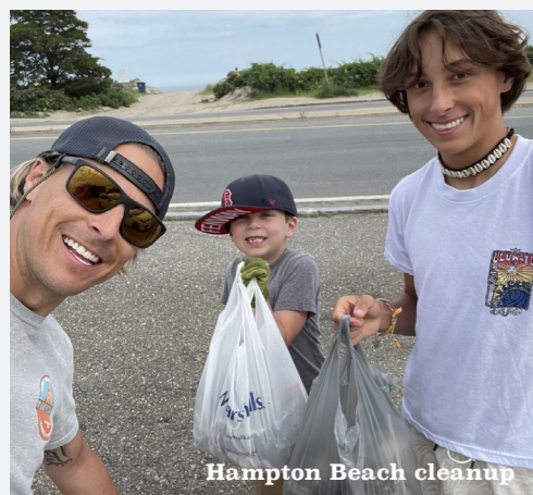
Hampton Beach cleanup