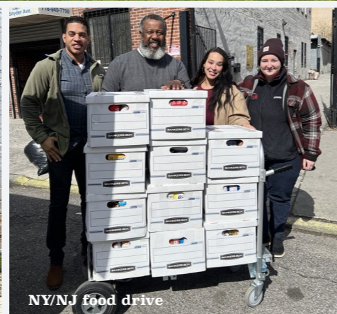
NY/NJ food drive